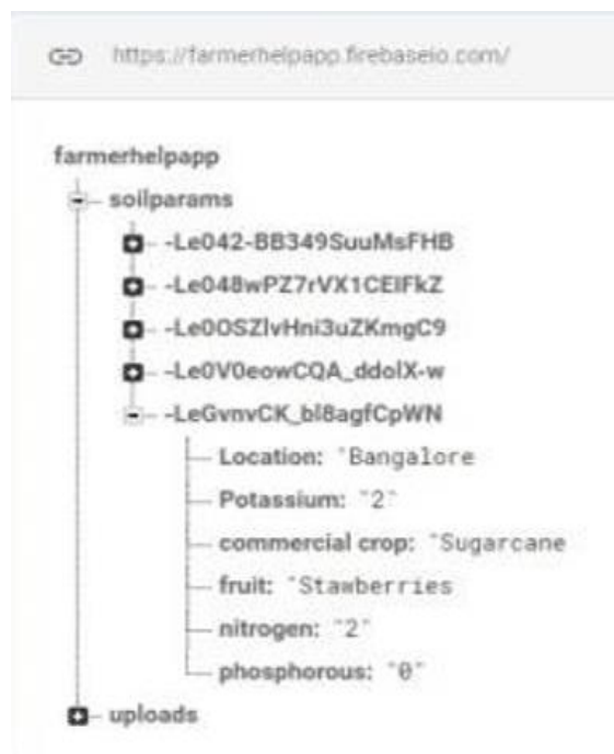
Figure 3. Firebase Real-time database

Data from the mobile application is stored using the Realtime Database i.e Google Fire-Base Realtime Database. Since it is a Realtime Database i.e NoSQL database, as a result, it tends to have different configurations and performance compared to related data. For this reason, it is important to consider how users need to access the data and use it accordingly, Figure 3 gives the graphical representation of the database.