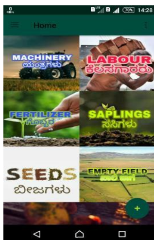
Figure 2. Android application.

The android application shown in figure 2, is created using Android studio which includes java and XML programming. Initially, users have to create an account using the signup option in the application. The data to the application is sent over the internet from the firebase. To increase user experience, the sensor values are preprocessed and sent to an android application through WIFI.