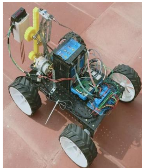
Figure 4 Robot with the sensors