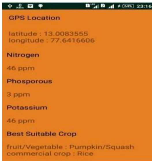
Figure 7. Best suitable crop prediction in android application

analyzed in the firebase real-time database where every value can be viewed in real-time. Figure 7 displays the N, P, and K values transmitted by the robot to the firebase database. The model can be controlled from anywhere by a remote desktop after getting the IP address. Which makes it user convenient.