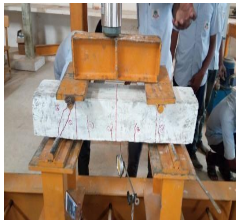
Fig 3. Testing of Specimen