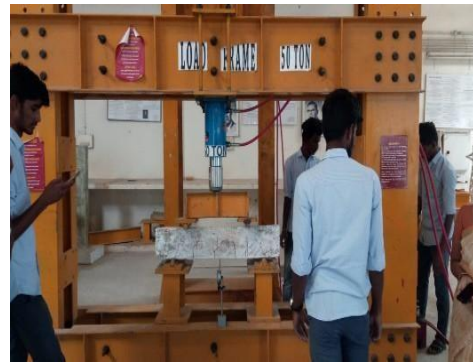
Fig 2. Test setup.

The beam after curing for 28 days are taken to test. A strong steel frame (loading frame) was used to test the specimens. The two static point loads with equal spacing of 1/3 from the ends of the beam was applied at the top surface by using hydraulic hand pump of capacity 500 kN. The load was first applied to the beams up to its initial cracking and the values are noted. And then loading process were continued on the beam to get second crack and the values are noted.