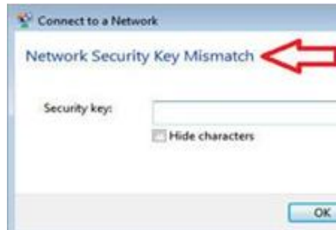
Fig.3.Security Key Mismatch