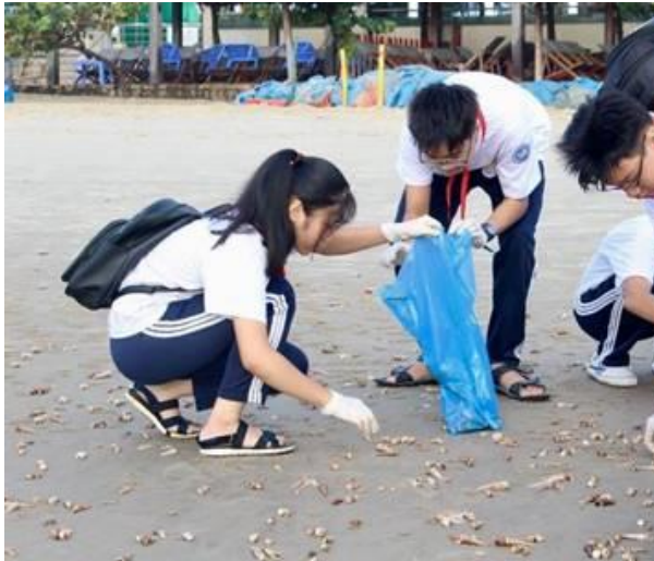
Figure 3. Extracurricular educational activities regarding environmental protection

Extracurricular educational activities in elementary schools need to be rich. Unlike class hours, after-school educational activities in elementary schools are open, have a vibrant, free atmosphere and promote a positive and proactive character of each student. Therefore, this activity will create excitement and voluntary participation of children in environmental protection (Figure 3).